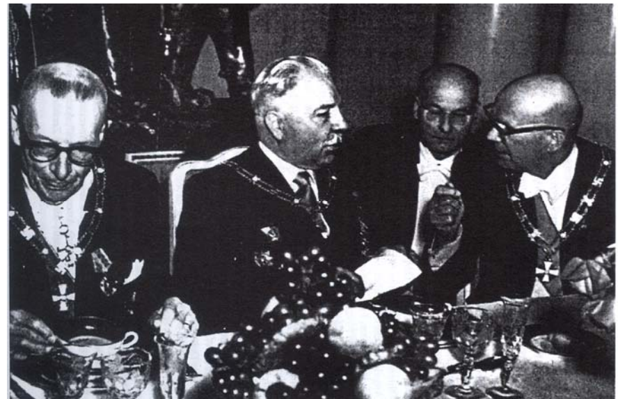
Banquet hosted by the President of the Republic of Finland in honour of K. E. Voroshilov, on Aug. 21 st 1951. U. K. Kekkonen (right), J. K. Paasikivi (left)

on the British Isles at the beginning of this century (‘Thule’ and others), but the modern ‘Eurasians’ demonstrate their radical opposition towards the West.